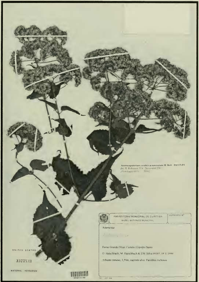
Fig. 1. Austro eupatorium cordato-acuminatum H. Robinson, isotype, United States National Herbarium (US).